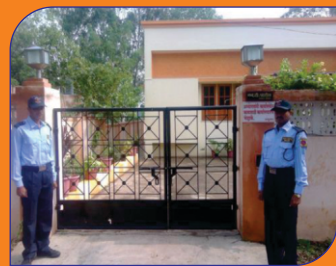
24 HOURS SECURITY